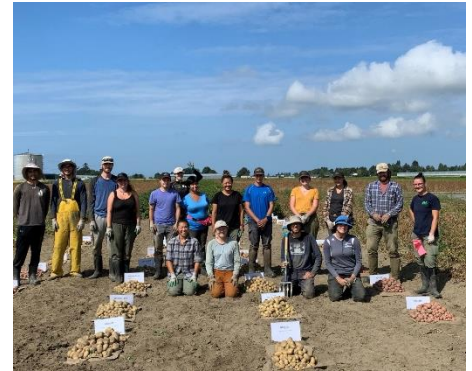
Figure 1. Demonstration plots were harvested for display on August 18 th , 2021.