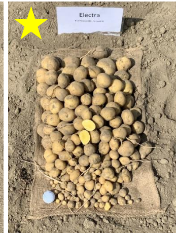
Figure 10. Yellow skinned/flesh varieties along with their replicated trial yield (t/ac). Star denoting highest yielding variety. Golf ball for size reference.