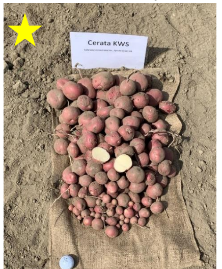
Figure 5. Red skinned varieties along with their replicated trial yield (t/ac). Star denoting highest yielding variety. Golf ball for size reference.