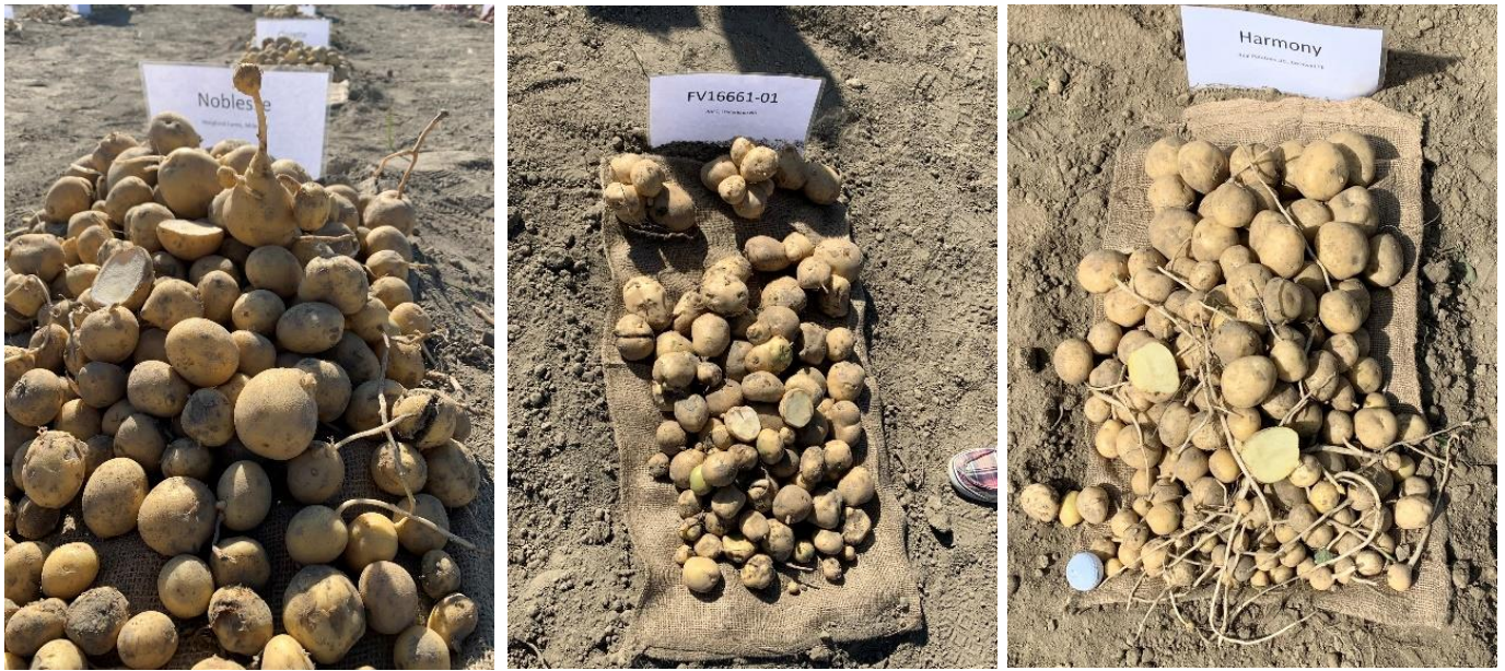
Figure 3. Varieties Noblesse, FV 16661-01, and Harmony were amongst varieties displaying heat stress symptoms during the 2021 PVT.