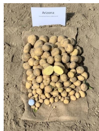
Figure 10. Yellow skinned/flesh varieties along with their replicated trial yield (t/ac). Golf ball for size reference.