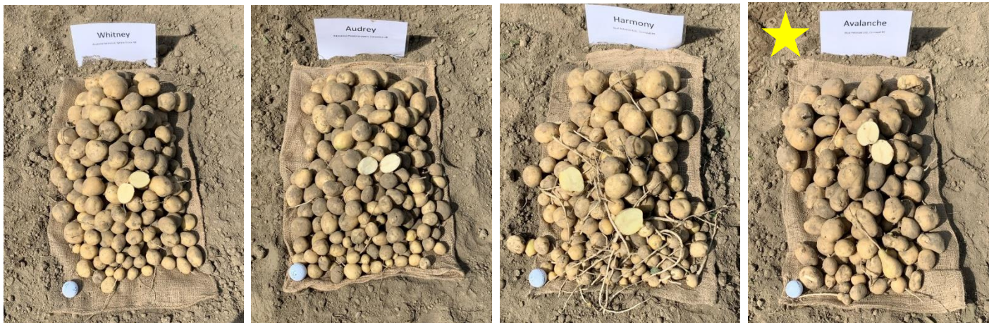
Figure 9. White skinned varieties along with their replicated trial yield (t/ac). Star denoting highest yielding variety. Golf ball for size reference.