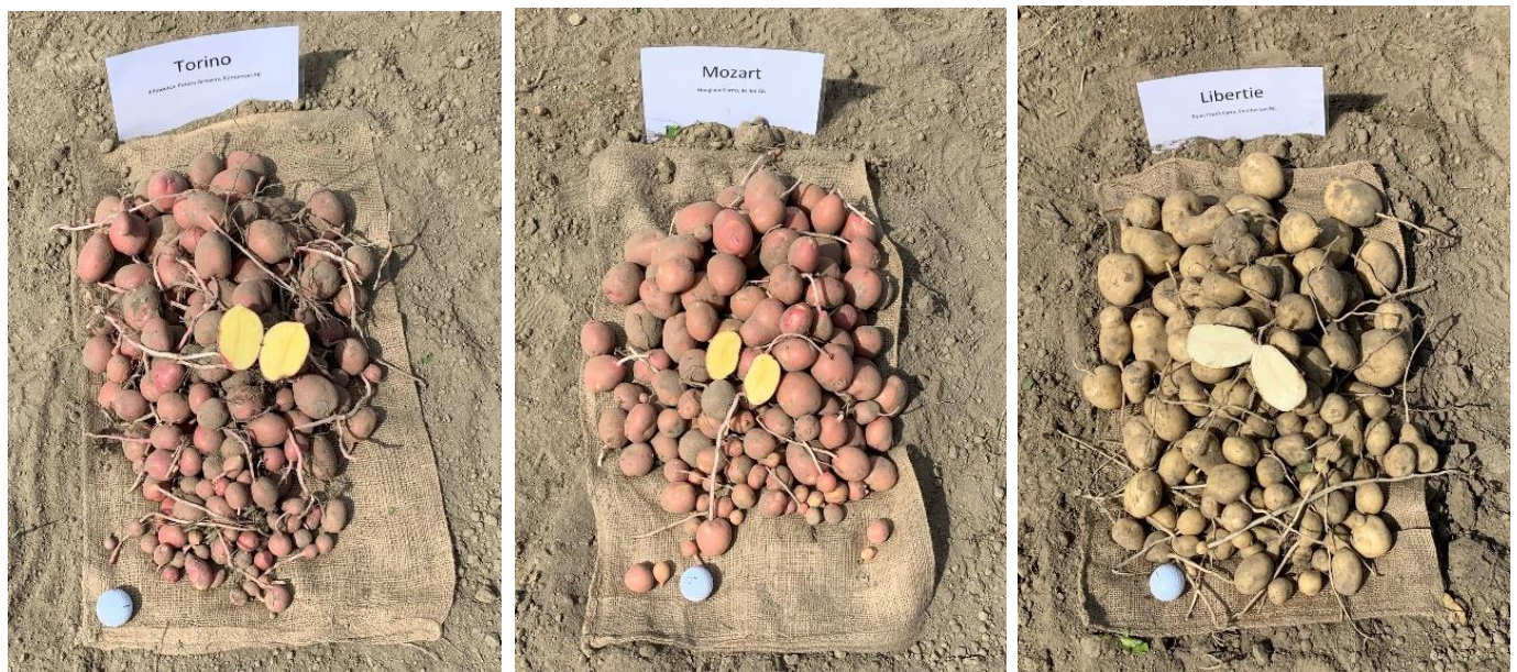
Figure 2. Varieties Torino, Mozart, and Libertie were amongst varieties displaying heat stress symptoms during the 2021 PVT.

Impacts of Heat- A number of varieties showed stress responses to the heat, including chaining, sprouting of tubers, and misshapen tubers. The varieties showing the severe heat stress symptoms included Torino, Mozart, Libertie, Noblesse, FV 16661-01, and Harmony (Figs. 2&3).