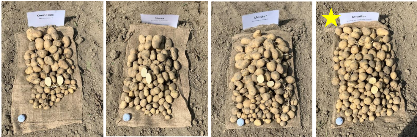
Figure 8. Dual purpose/processing varieties along with their replicated trial yield (t/ac). Star denoting highest yielding variety. Golf ball for size reference.