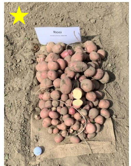
Figure 6. Red skinned yellow flesh varieties along with their replicated trial yield (t/ac). Star denoting highest yielding variety. Golf ball for size reference.